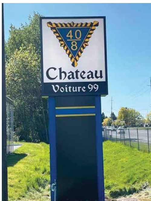
Above: New street side sign for Voiture 99, Vancouver Washington.