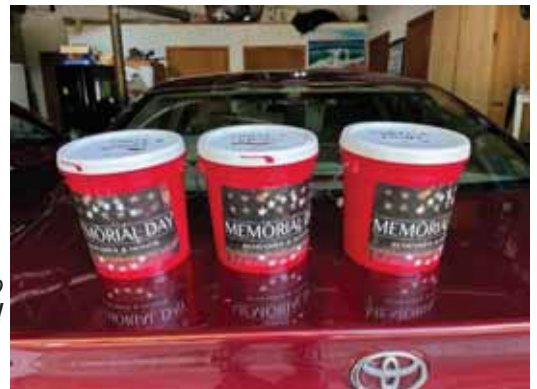
Right: A great idea to remind folks that it's OK to put money in the buckets!