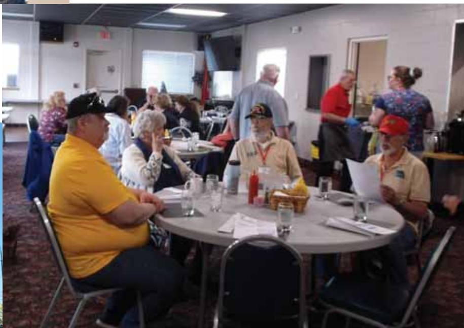
Above: Members of the Great Western met for lunch at Voiture 99 after tours.